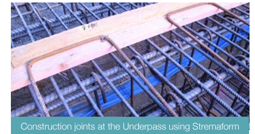
Construction joints at the Underpass using Stremaform

“Stremaform® offered us the ability to set up our construction joints well ahead of schedule without having to return to the joint after a concrete pour to remove traditional formwork. The joint finish allows us to fix steel continually, without any remedial work to the concrete or waiting for formwork to be removed. Stremaform® is a great product which we will be looking at using on future projects.”