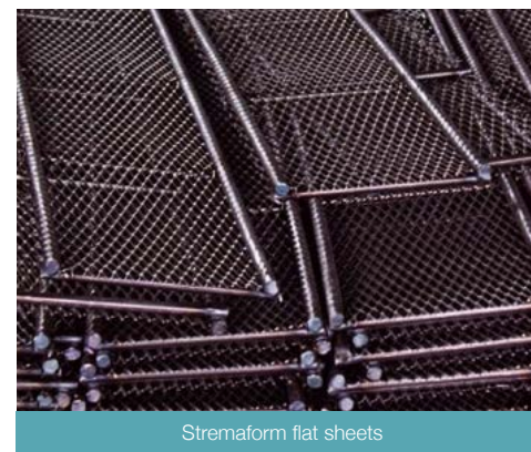
Stremaform flat sheets

Once the slab pours commenced on site in December 2013, the true advantage of Stremaform® became clear to the Alliance: