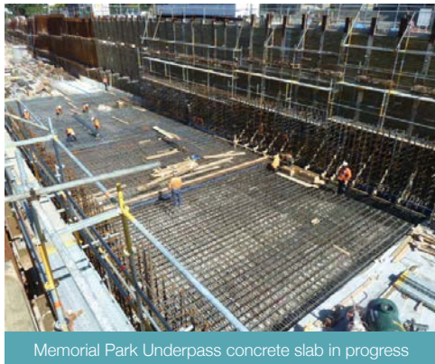
Memorial Park Underpass concrete slab in progress

To speed up the construction of the new “cut and cover” trench slab, the engineers looked to Stremaform® for their construction joints. The product’s performance allowed a higher speed of concrete pour than traditional methods.